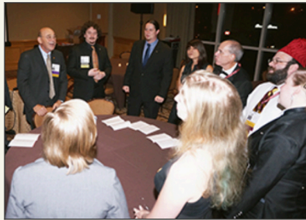
Committee Meetings Closing Sessions Awards Banquet

Use this link to view the Convention photos on Flickr