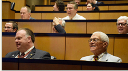
Leadership Institute Founders Society and Scholarship Luncheon Dinner Cruise