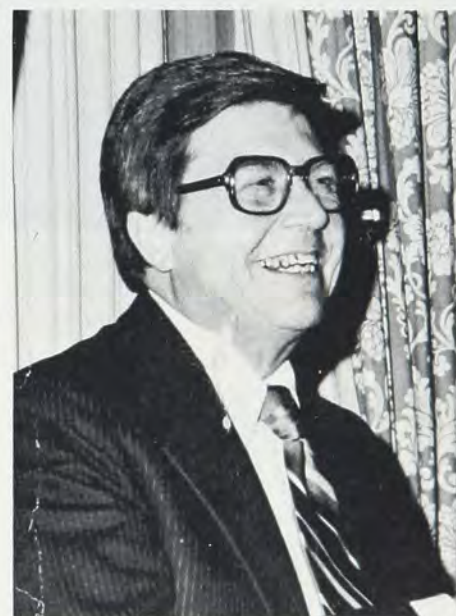
Jerald F. terHorst, Epsilon Nu '43, principal speaker at the Founders' Day Dinner in New York.