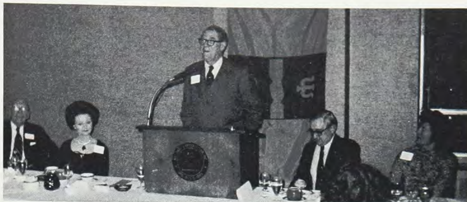
Clark MacGregor, Zeta '44-Mu '48, speaker of the evening at the Founders' Day Dinner in Washington, D. C.