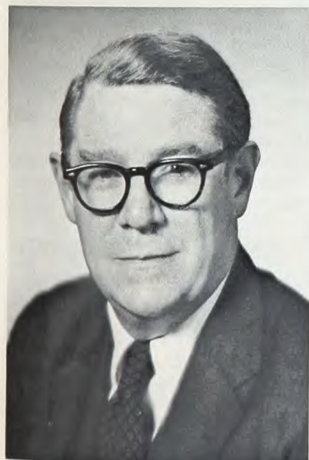
Clark MacGregor, Zeta '44-Mu '48, former Counsel to the President for Congressional Relations.

Actually this was one of three Psi Upsilon events scheduled in the Capital City that weekend. It was preceded by the winter meeting of the Executive Council earlier in the day, and the Southeastern Regional Conference for undergraduates took place the following day at George Washington University.