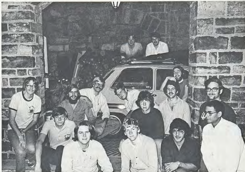
Some Brothers of the Eta with Le Car in "Le Pit"